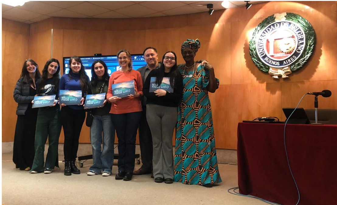
Figure 3: The fortunate ones who won the books.

As a surprise for the audience and not included in the program, five printed copies in full color were the coveted prizes of a raffle.