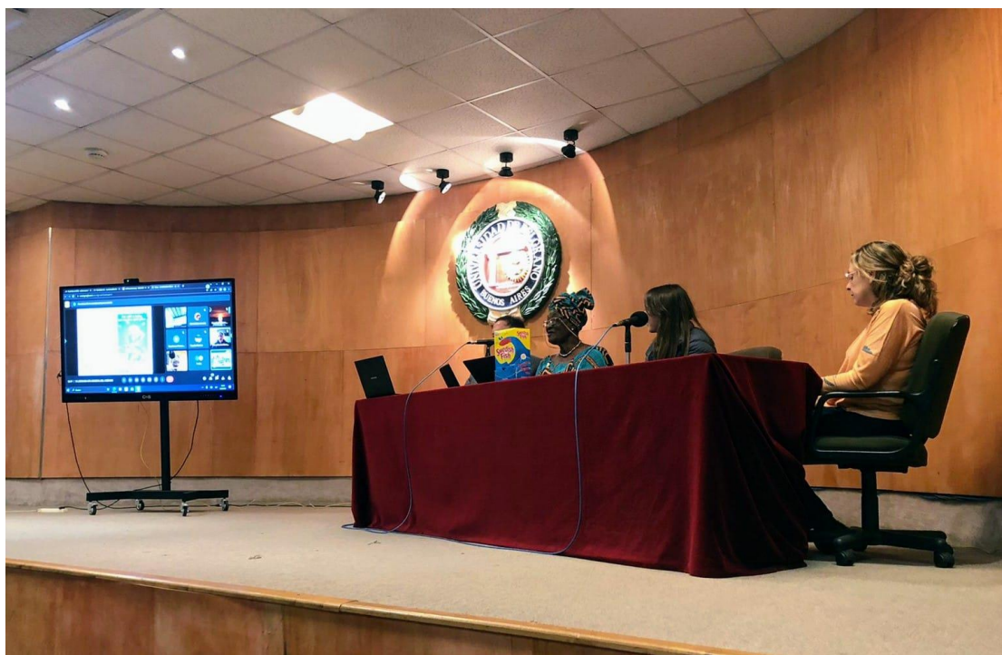
Figure 2: During the panel's presentation, which included remote speakers.

The activity was hybrid with participants from different countries, particularly in Latin America.