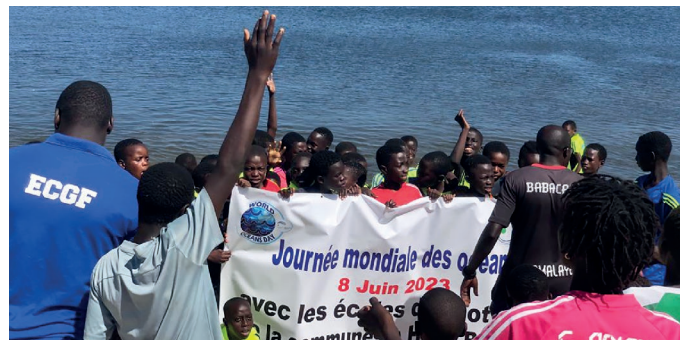
Celebrating in Senegal