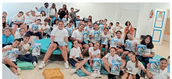
Celebrating in the Canary Islands