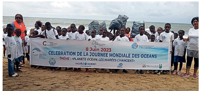
Celebrating in Cameroon ·

As every year, Mundus maris celebrated World Ocean Day, 8 June, across three continents, organizing clean-up drives, educational events, and community engagements. Activities aimed to raise awareness about ocean conservation and the importance of sustainable practices. The organization's international participation highlighted its commitment to promoting ocean literacy and stewardship together with partners and sympathisers in Africa, Europe and Latin America.