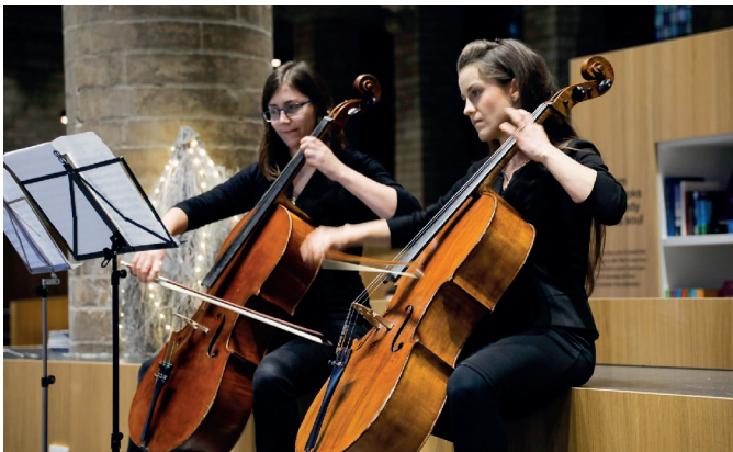
A much acclaimed concert in Ostende, Belgium