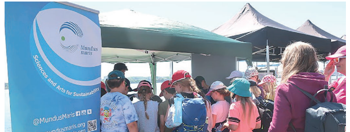
Celebrating in Kiel, Germany

As every year, Mundus maris celebrated World Ocean Day, 8 June, across three continents, organizing clean-up drives, educational events, and community engagements. Activities aimed to raise awareness about ocean conservation and the importance of sustainable practices. The organization's international participation highlighted its commitment to promoting ocean literacy and stewardship together with partners and sympathisers in Africa, Europe and Latin America.