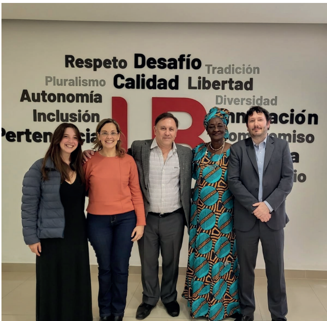
Event organisers in Buenos Aires