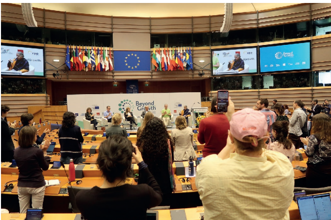
Beyond Growth Conference in Brussels

From 15 to 17 May 2023 the European Parliament welcomed more than 2000, mostly young, citizens for extensive exchanges with a broad spectrum of thematic and political speakers. At the centre of the conference was the challenge how to turn our backs on the illusion of eternal growth on a finite planet and stop plundering and wasting resources destroying our home in the process. How can we share the world's resources in ways that provide the basic living conditions for all. 'Sufficiency' and focus on well-being were concepts put forward as participants were unhappy with measuring 'progress' through deeply misleading and simplistic GDP. They left the event elated and charged up to work towards using better people and nature-based systems and indicators. Mundus maris attended and reported. A big win for civil society. Find out more.